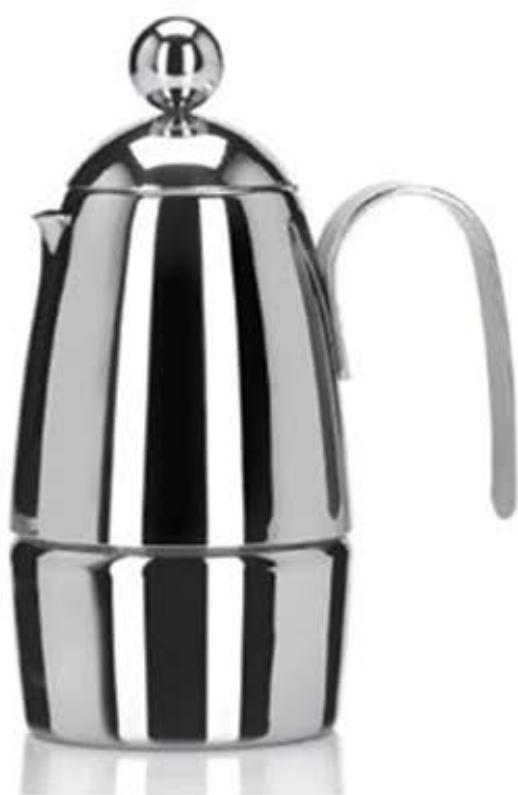
Gilda - Art. 702

Makes 2 cups • Capacity: 11 cl • Height: 15.5 cm • Diameter: 6 cm